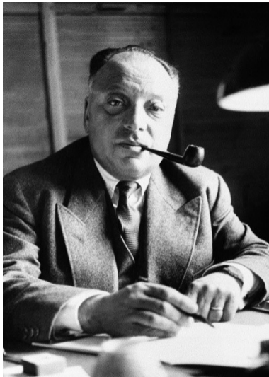
Wolfgang Pauli 1900-1958